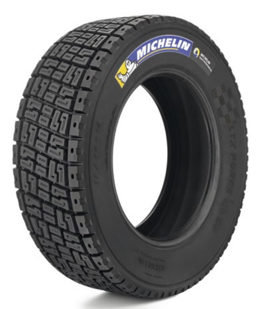
17/65-15 LTX Force T XL 90